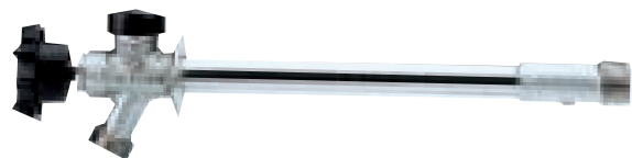
FIG:F2264A (1/2"Fx3/4"M INLET)