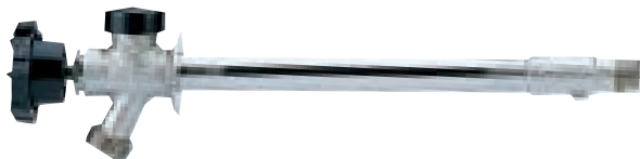
FIG:F2264 (1/2"Cx1/2"M INLET)