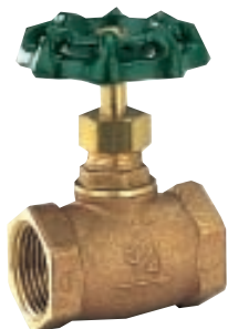
BRASS: FIG/F1131 BRONZE: FIG/F1231