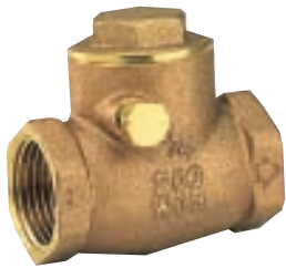
BRASS FIG:F1151S BRONZE FIG:F1251S